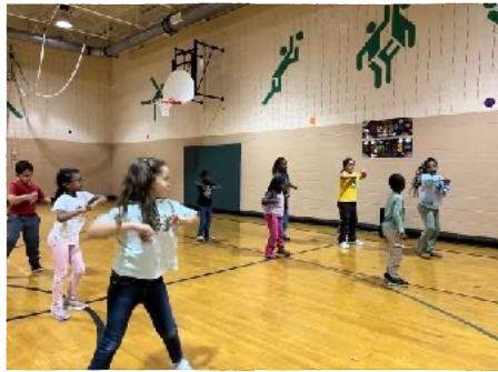
Our dance team in rehearsal!

except for December 24th, 25th, and 26th, when we will be closed in observance of the holiday. On Tuesday, December 31st, for NYE KidsCo will be open from 8:30 am to 3:00 pm. We will be closed on New Year's Day, and all students will return on Thursday, January 2nd. Please note that during Winter Break, we will be consolidating some of our locations. For specific details about your site's winter break location, please refer to the newsletter announcements or contact your center director. As the weather turns colder, we kindly ask that you send your child with appropriate warm clothing to ensure they can fully enjoy our outdoor activities. If you have any questions or concerns, please don't hesitate to contact the Main Office at 301-740-9600. We hope you have a delightful winter break filled with precious moments with family and friends.