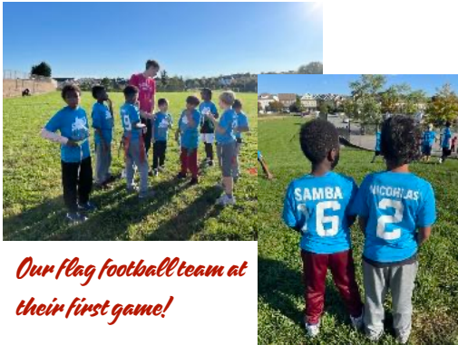
Our flag football team at their first game!

& 26th because of the school half days. Then school and KidsCo will be closed Wednesday the 27th through Friday the 29th for the holiday. Enjoy this time with your families! For any questions or concerns please contact the Main Office: 301-740-9600. Thank you!!!